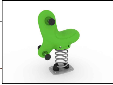
Proposed Springie (Hags spring toy klimp)